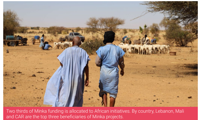
Two thirds of Minka funding is allocated to African initiatives. By country, Lebanon, Mali and CAR are the top three beneficiaries of Minka projects.

Growth and improvement of Minka’s tools made it possible to conduct an independent evaluation from 2021, to learn from the experience gained and to meet the needs of accountability.